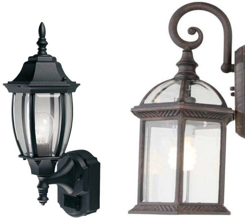
Attachment 1 (lights)